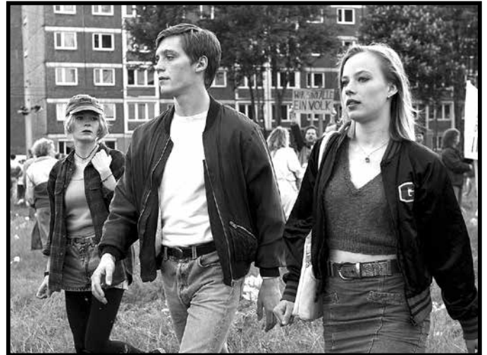
WE ARE YOUNG. WE ARE STRONG, March 27, 30