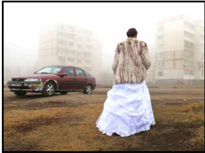
HEARTS KNOW* THE RUNAWAY BRIDES , March 27, 28