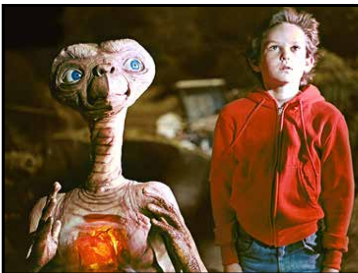
E.T. THE EXTRA-TERRESTRIAL, March 29