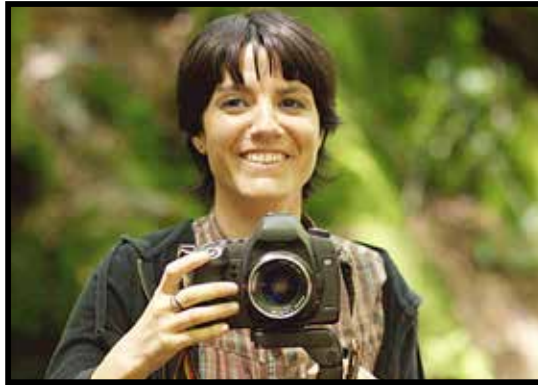
AMAMA, March 12, 24

This powerfully visualized drama centers on a Basque farm that has been in the same family for generations. When the eldest son leaves, the burden passes to his sister, an artist who finds herself at odds with her traditionalist father. In Basque with English subtitles. (MR)