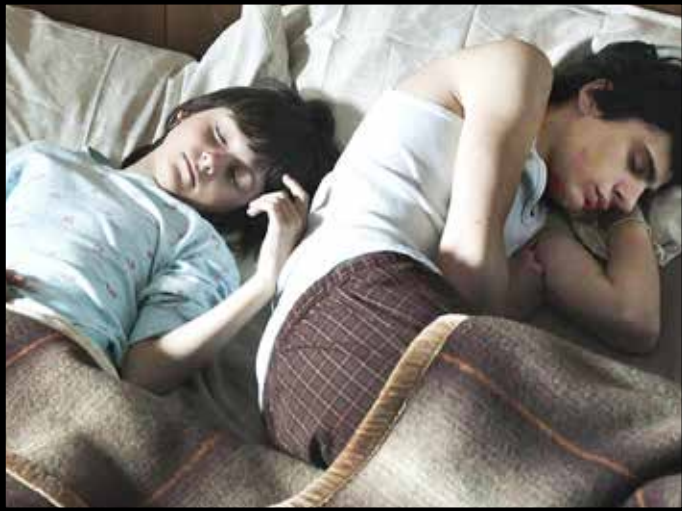
THE TREE, March 5, 7