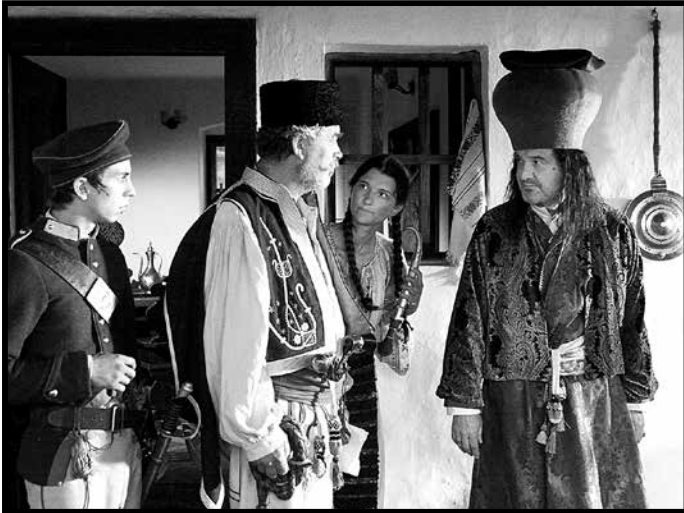
AFERIM! , March 6, 9