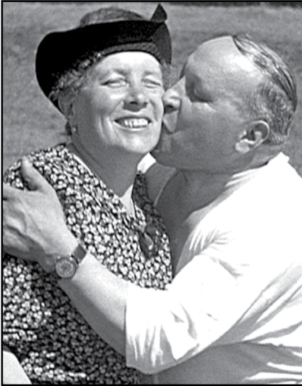
FROM SCOTLAND WITH LOVE, March 19, 25