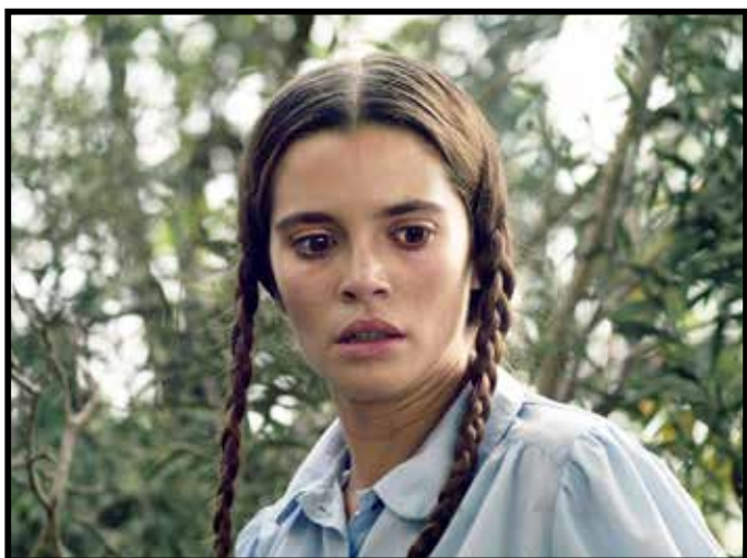
AT AN UNCERTAIN TIME , March 26, 31