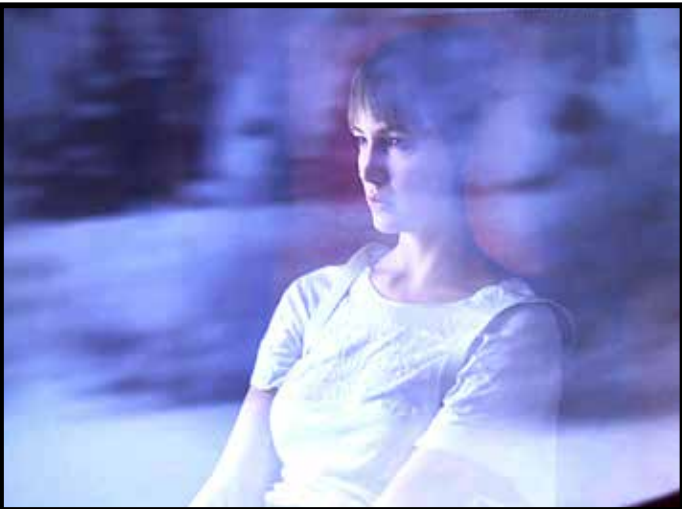
HOW TO STOP A WEDDING, March 26, 28