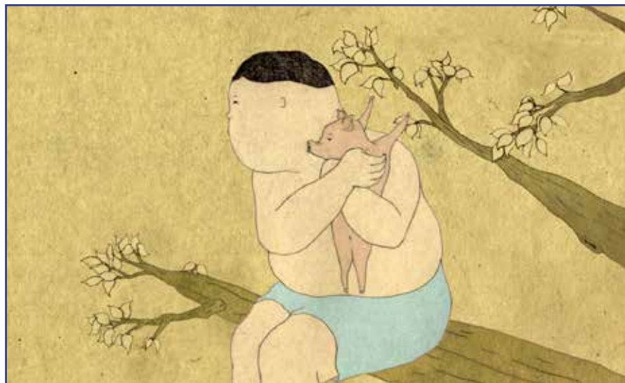
Wonder: Recent Independent Animation from Japan, March 10