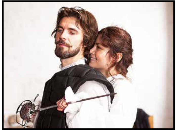
THE GIRL KING , March 25, 26