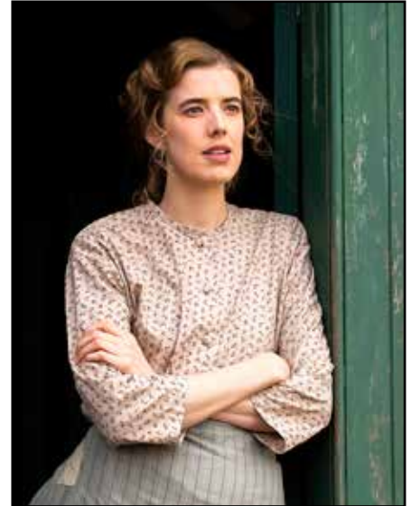
SUNSET SONG, March 18, 19

This definitive film portrait tracks Britain's greatest living artist through his many stages, from Yorkshire lad to Swinging London scene-maker to pioneer gay artist to chronicler of L.A.'s swimming-pool culture to innovative wielder of Polaroids and iPads. In English. (MR)