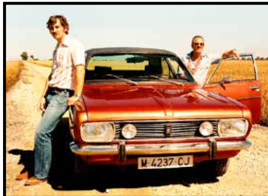
MARSHLAND, March 6, 7

In this sprightly meta-movie, an Argentinian screenwriter is hired to pen a Madrid-set rom-com, but, as he becomes increasingly aware of the contrast with his own troubled marriage, his real and fictional worlds begin to merge. In Spanish with English subtitles. (MR)