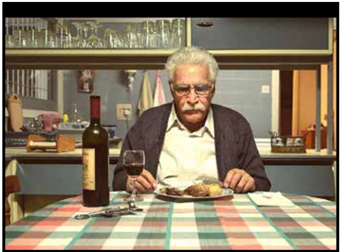
FAMILY MEMBER , March 11, 14