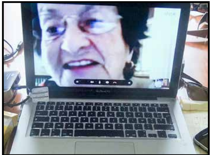
NO HOME MOVIE, March 19