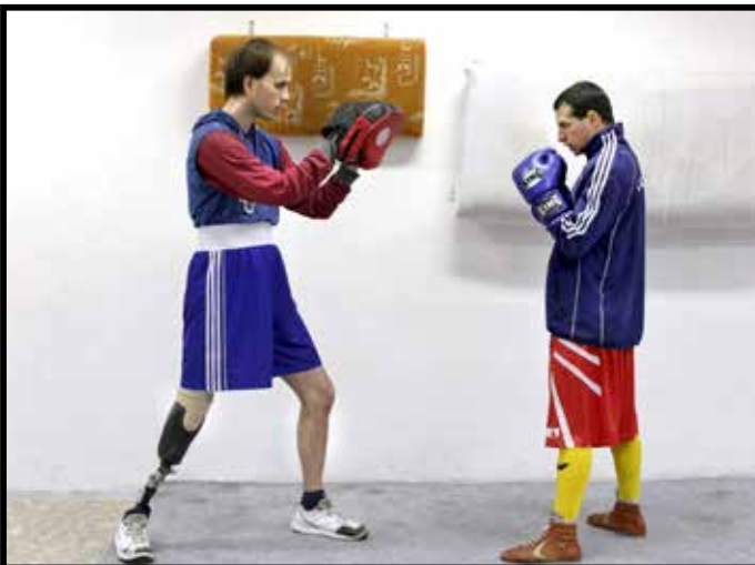
KOZA , March 18, 22