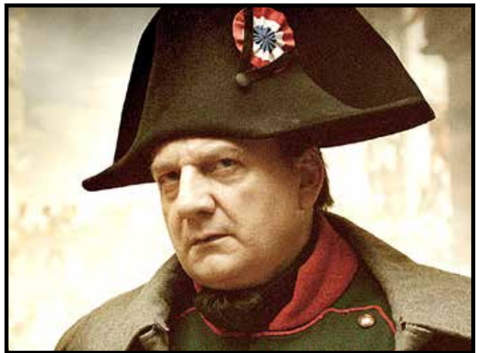
FRANCOFONIA , March 16