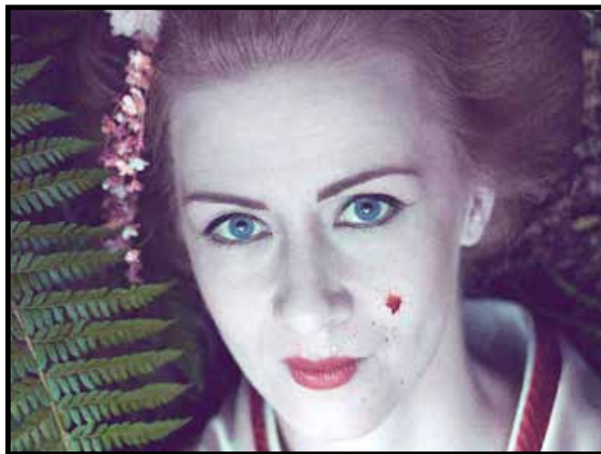
LIZA, THE FOX-FAIRY, March 5, 8