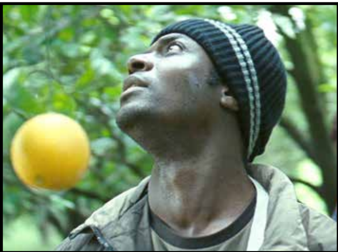
MEDITERRANEA, March 20, 24