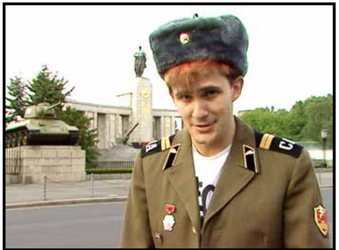
B-MOVIE, March 18, 23