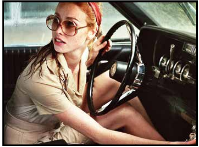
THE LADY IN THE CAR WITH GLASSES AND A GUN, March 25, 31