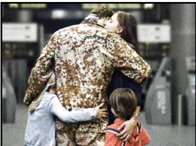
A WAR , March 25, 26