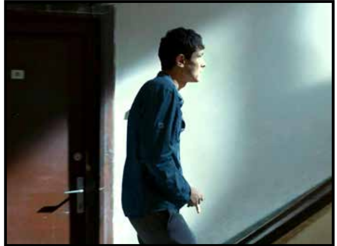
ONE FLOOR BELOW , March 20, 24