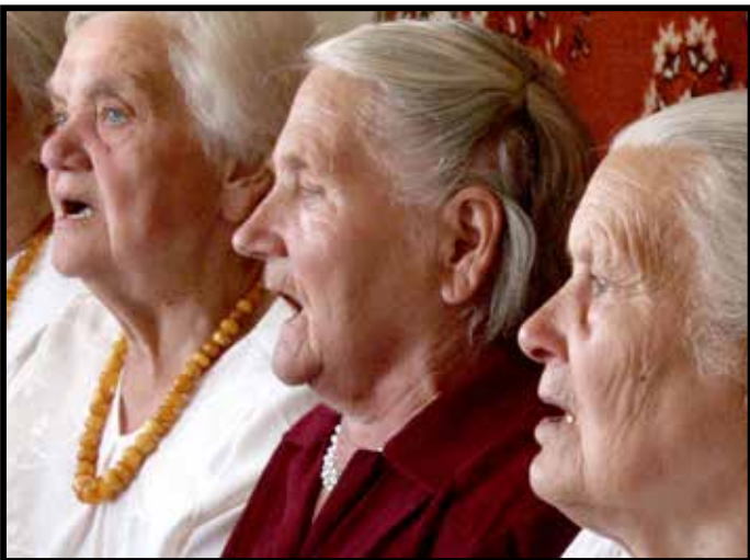
LAND OF SONGS , March 19, 21