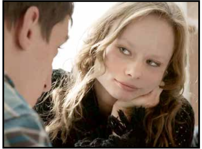
MODRIS , March 8, 15