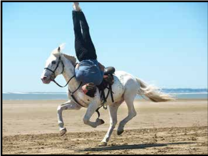
IN HARMONY, March 5, 7