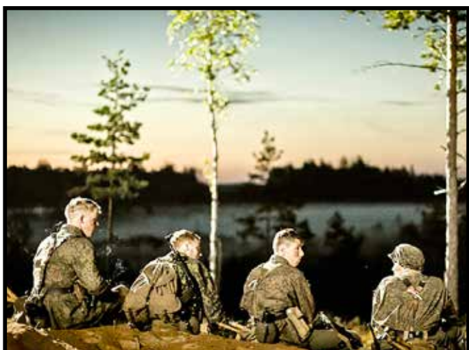
1944 , March 26, 29