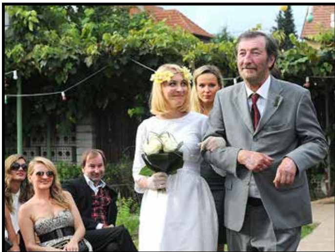
HOME CARE , March 12, 15