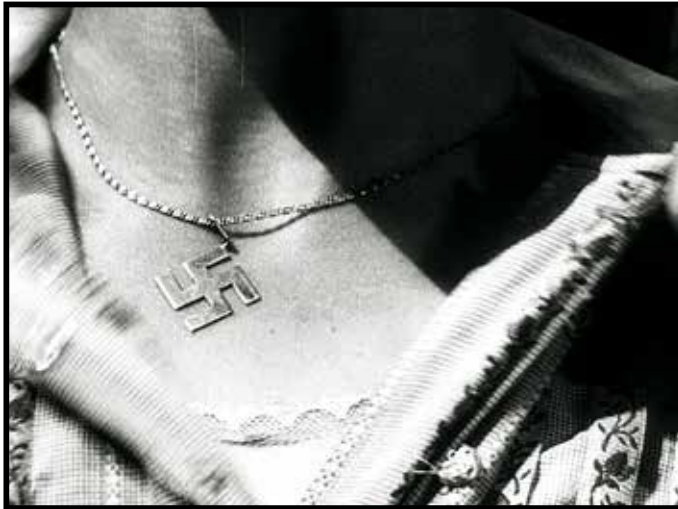
FORBIDDEN FILMS, March 6, 9