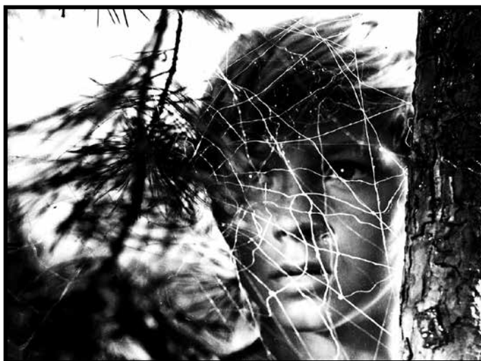
IVAN'S CHILDHOOD, March 15

Spielberg's classic fantasy is at heart a love-letter to American suburbia, catalyzed by a benign alien castaway who is sheltered by a ten-year-old boy (Thomas). Original release version. 35mm. (MR)