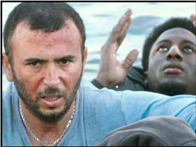
SIMSHAR , March 9, 14