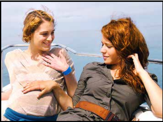
LOVE ISLAND March 5, 14