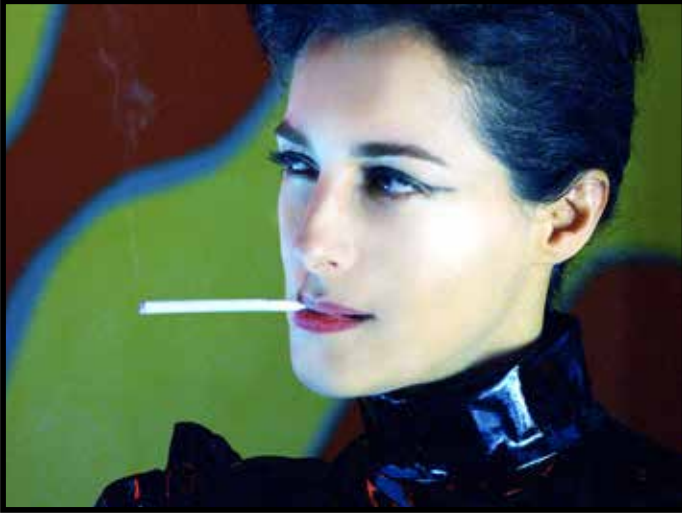
THE LAST SUMMER OF THE RICH, March 25, 29