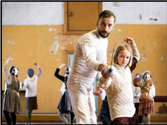
THE FENCER , March 8, 11