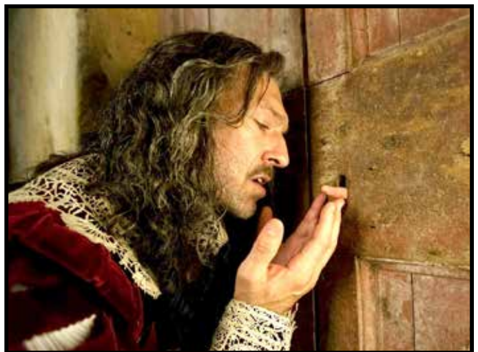
TALE OF TALES, March 27, 30