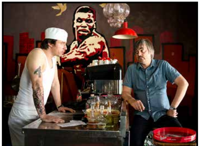
ŠIŠKA DELUXE , March 19, 22