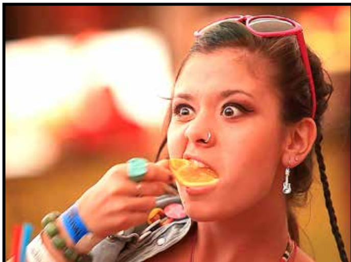
FREE ENTRY, March 13, 17