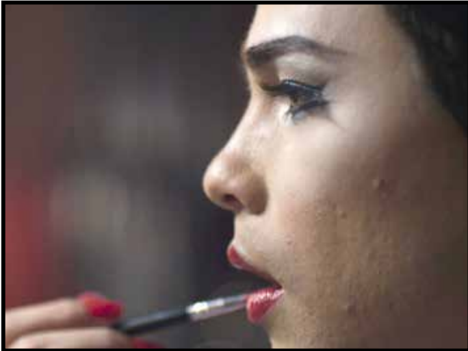
VIVA, March 13, 14