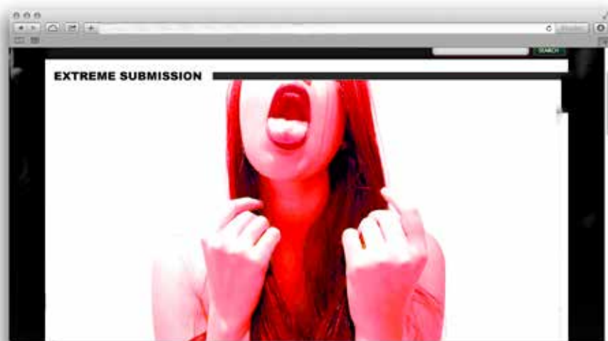
shawné michaelain holloway: Extreme Submission, March 17