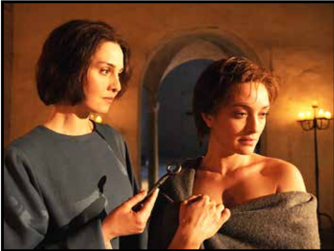
WONDROUS BOCCACCIO , March 11, 16