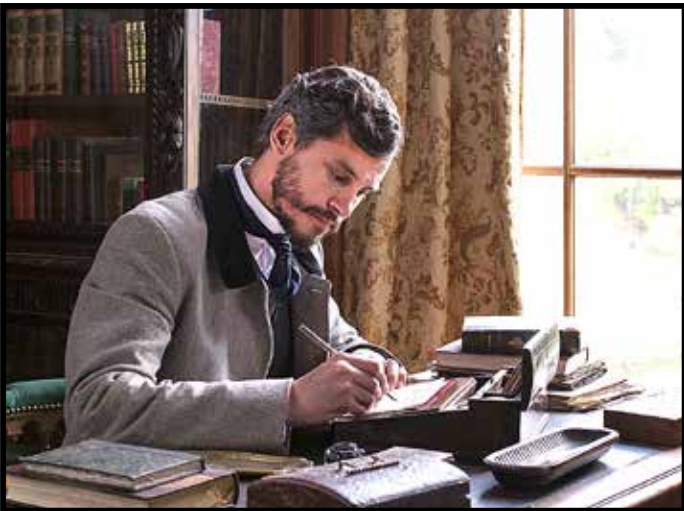
ANTON CHEKHOV 1890 , March 6, 10