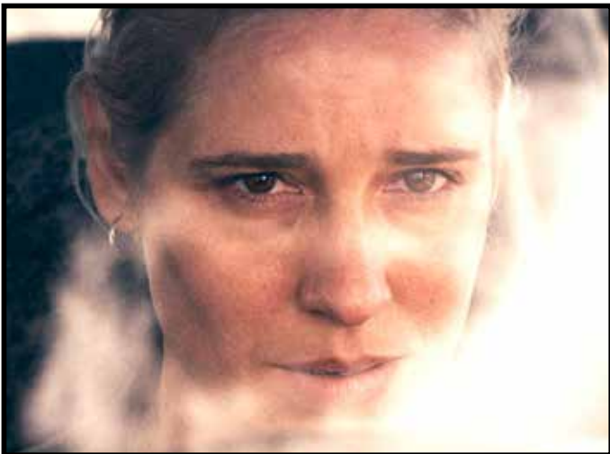
A BLAST, March 19, 21