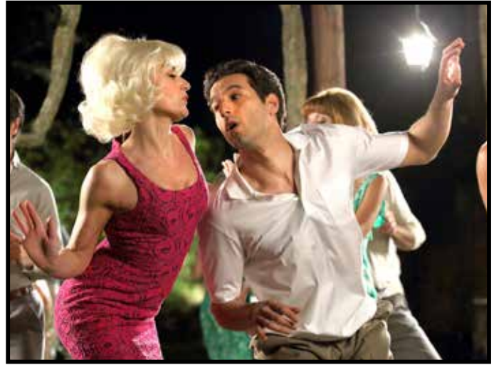
LATIN LOVER, March 5, 8