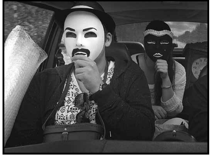
THE GARBAGE HELICOPTER, March 11, 13