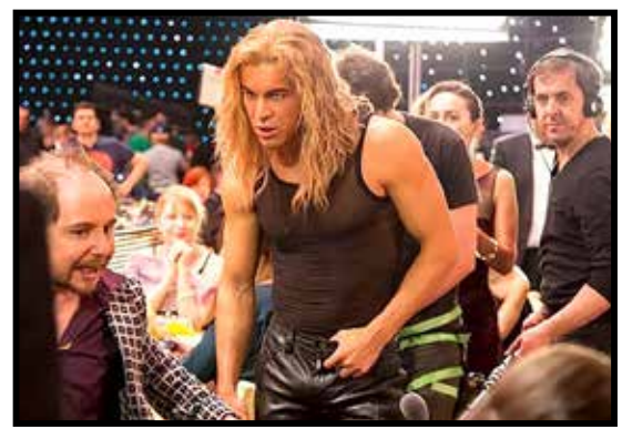
MY BIG NIGHT, March 26, 30