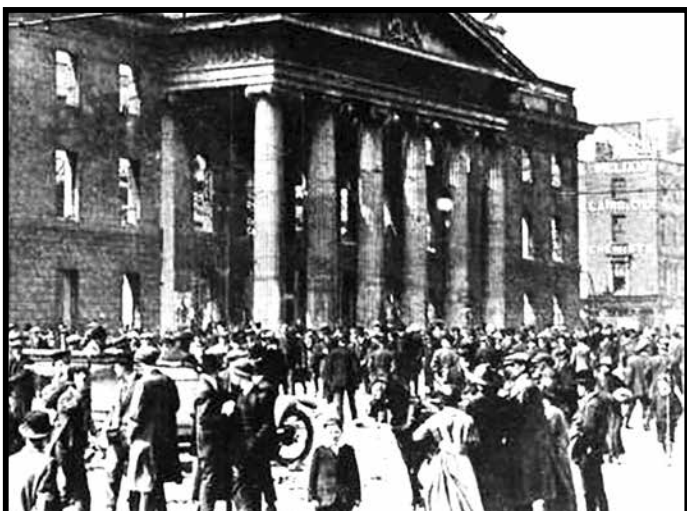
1916: THE IRISH REBELLION, March 21