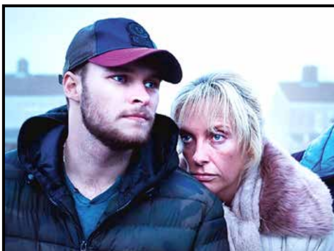
GLASSLAND, March 5, 9