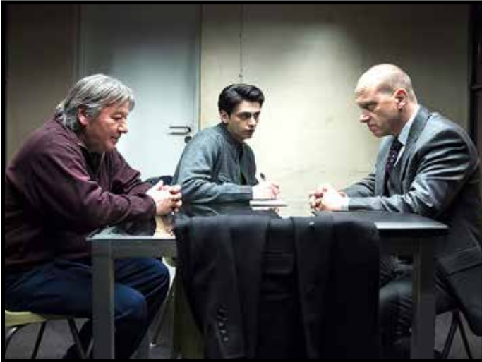
THE PROSECUTOR, THE DEFENDER ... , March 27, 30