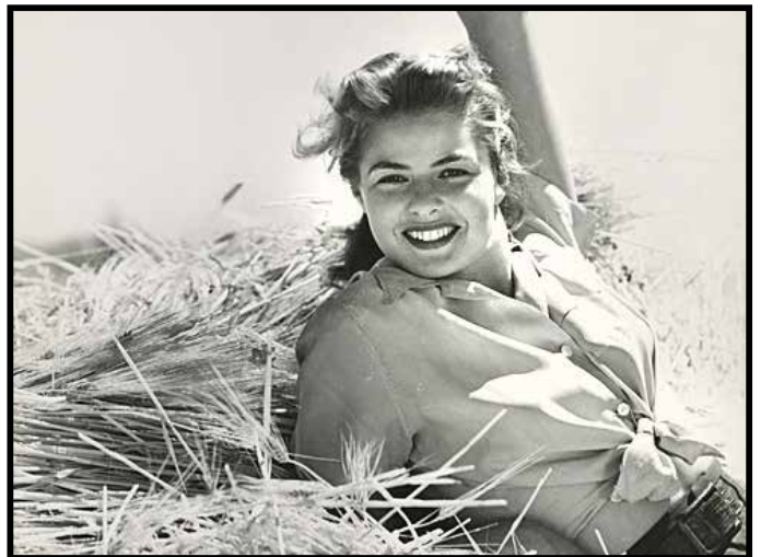
INGRID BERGMAN — IN HER OWN WORDS, March 11, 12