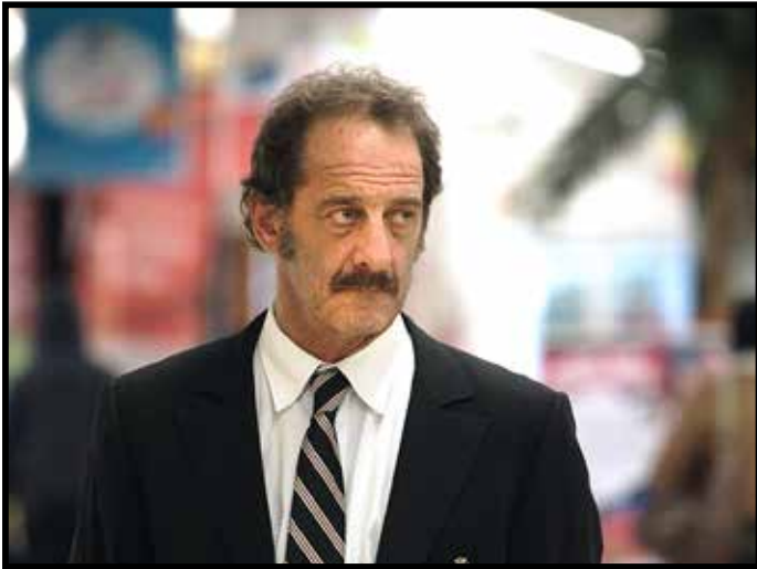
THE MEASURE OF A MAN, March 26