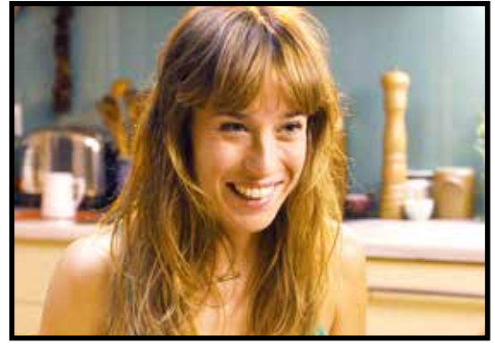
EASY SEX, SAD MOVIES, March 18, 23