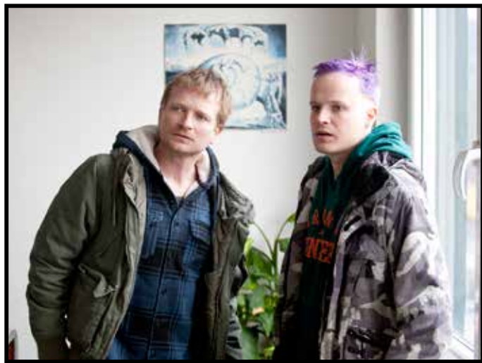
THE SNAKE BROTHERS , March 5, 7