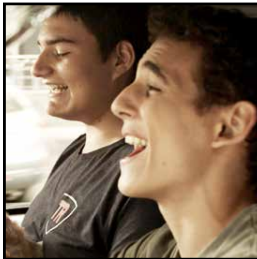
NOTHING IN RETURN, March 17, 18

Winner of ten Goya awards (including Best Picture, Director, Actor), this atmospheric, politically charged thriller, set in 1980, brings two Madrid cops to the Andalusian hinterlands to investigate the disappearance of two teenage girls. In Spanish with English subtitles. (MR)