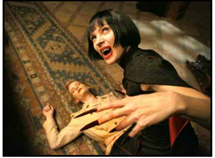
THERAPY FOR A VAMPIRE, March 19, 24