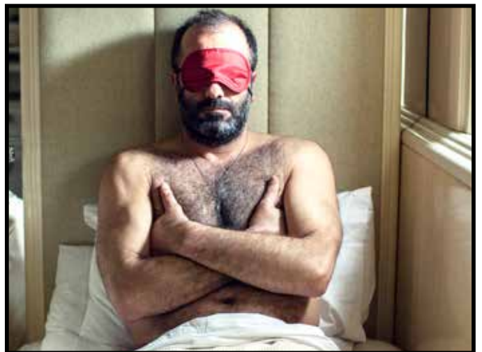
CHEVALIER, March 25, 28