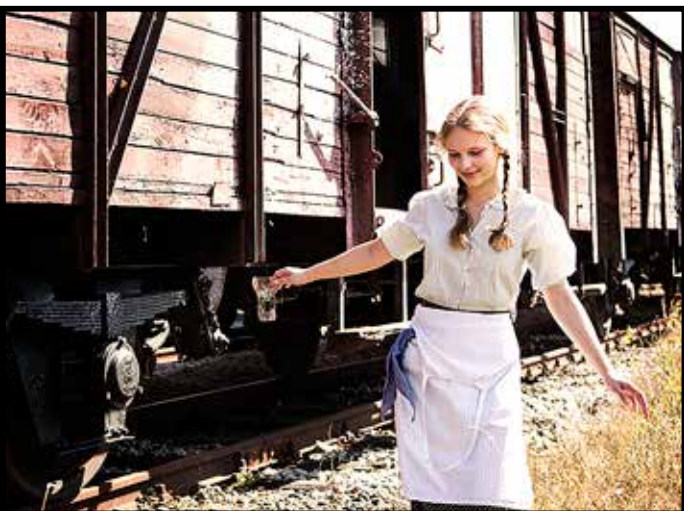
SUMMER SOLSTICE , March 12, 16