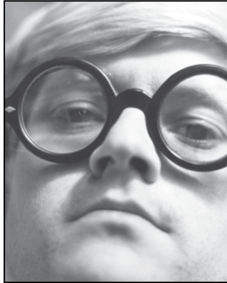
HOCKNEY, March 26, 28

From the shipbuilding banks of the Clyde to the highlands and the Hebrides, there is nary a tartan-tinged cliché in this haunting portrait of Scotland's twentieth century, composed entirely of archival footage from Scottish film archives. No dialogue; music by King Creosote. (BS)