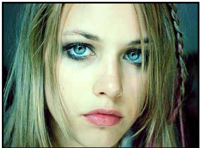
BABY (A)LONE , March 8, 10