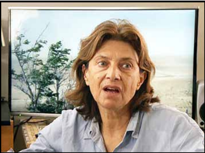
I DON'T BELONG ANYWHERE: THE CINEMA OF CHANTAL AKERMAN, March 19