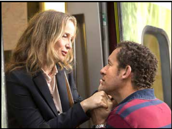
LOLO, March 13, 17